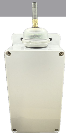
Suitable For Interior Or Exterior Use

*Note: Bluetooth Range is highly dependent on the integration of fixtures, surrounding environment and conditions. It is recommended to conduct testing for range accuracy.