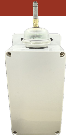
Suitable For Interior Or Exterior Use

*Note: Wireless Range is highly dependent on the integration of fixtures, surrounding environment and conditions. It is recommended to conduct testing for range accuracy.