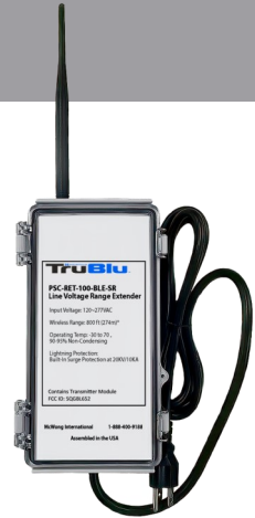
Suitable For Interior Or Exterior Use

*Note: Bluetooth Range is highly dependent on the integration of fixtures, surrounding environment and conditions. It is recommended to conduct testing for range accuracy.