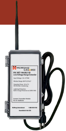
Suitable For Interior Or Exterior Use

*Note: Wireless Range is highly dependent on the integration of fixtures, surrounding environment and conditions. It is recommended to conduct testing for range accuracy.